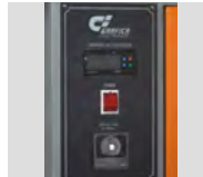
Temp Controller & Timer