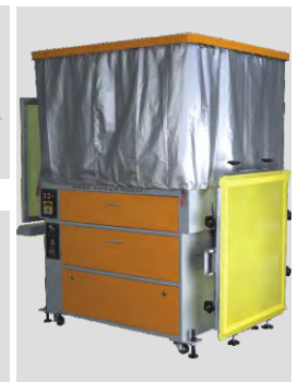
Foldable Stretching Device